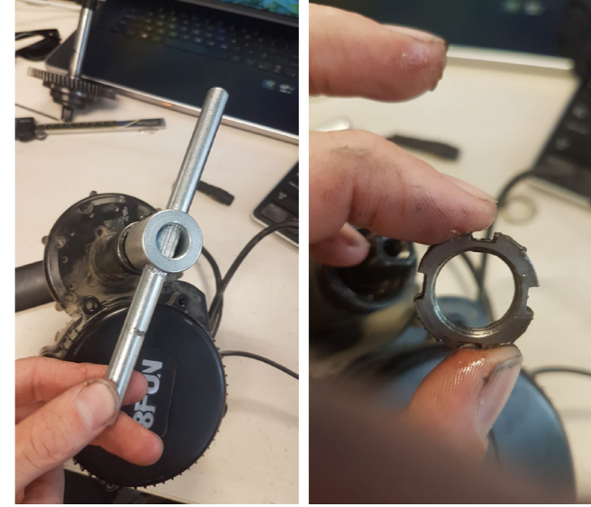
3. Remove 2x lock nuts Lekkie installation tool (put crank on drive side and hold)