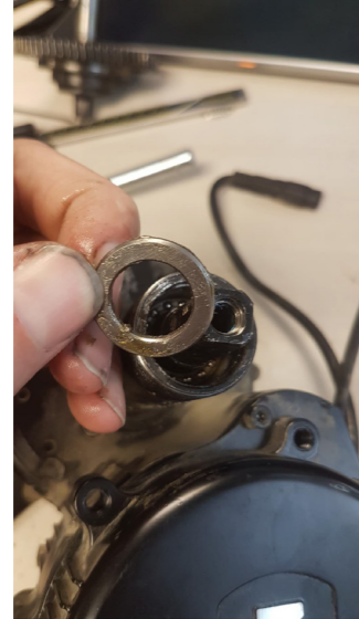
4. Remove bearing and race