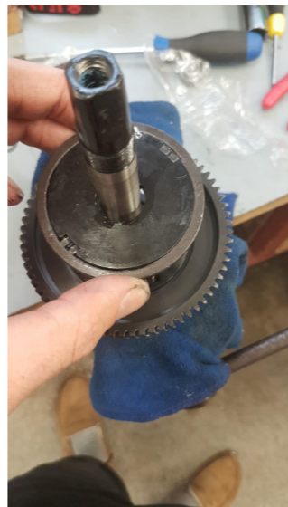
9. Slide Magnet off