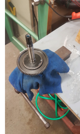
7. Fix Gear Mechanism in vice