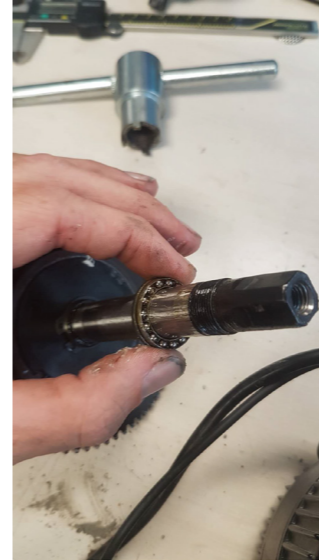
6. Slide drive side bearing and race