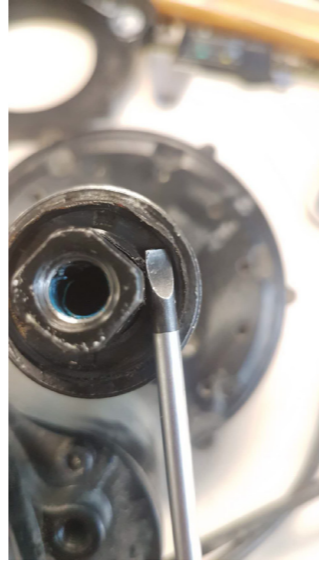
2. Remove rubber seal Small flat screwdriver under lip