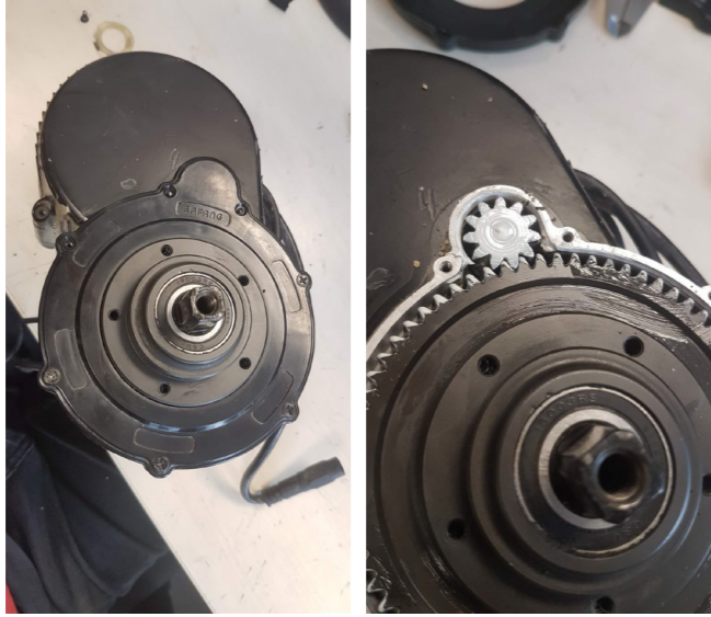
1. Remove plastic gear cover Phillips crew driver